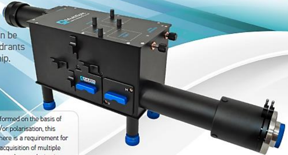
Image splitting is usually performed on the basis of wavelength, multi-depth and/or polarisation, this enables applications where there is a requirement for simultaneous, or high speed acquisition of multiple image emission bands, mini z stacks or polarisation states. The simultaneous acquisition of up to four images offers a major benefit over manual or electronic filter changers, as there is no longer a need to pause acquisition while the filter position is changed. This allows cameras to be operated in high speed stream modes and reduces the demand on software.

The MultiSplit image splitter from Cairn Research provides four separate, spatially equivalent image components which can be displayed as four quadrants on a single camera chip.